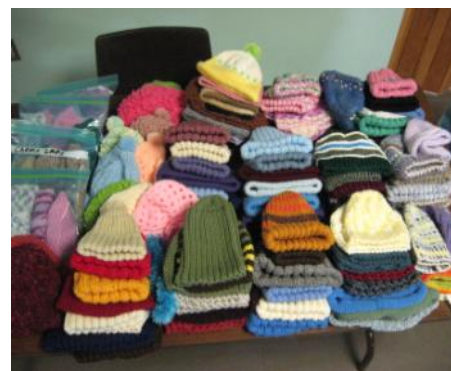
Above: Some of the items donated at the 2011 Knit-a-thon.