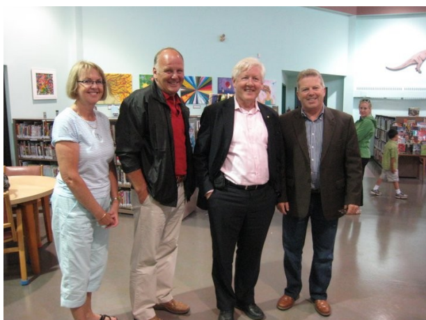
Pictured above: Jane Cordy, Mark Eyking, Bob Rae, and Rodger Cuzner.